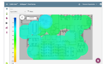
Share and visualize survey data through cloud-based Link-Live Service.