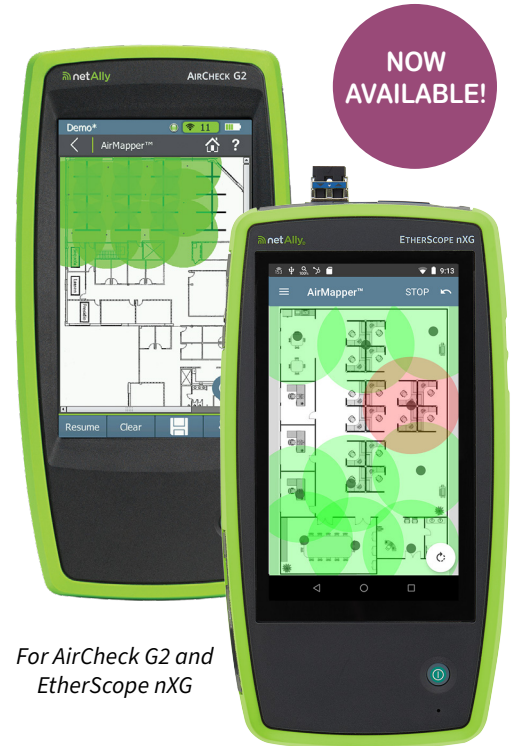
For AirCheck G2 and EtherScope nXG

With the cloud-based Link-Live service or AirMagnet Survey PRO creating powerful visualizations of the recorded data, centralized engineers can analyze test results from far-flung remote sites without travel.